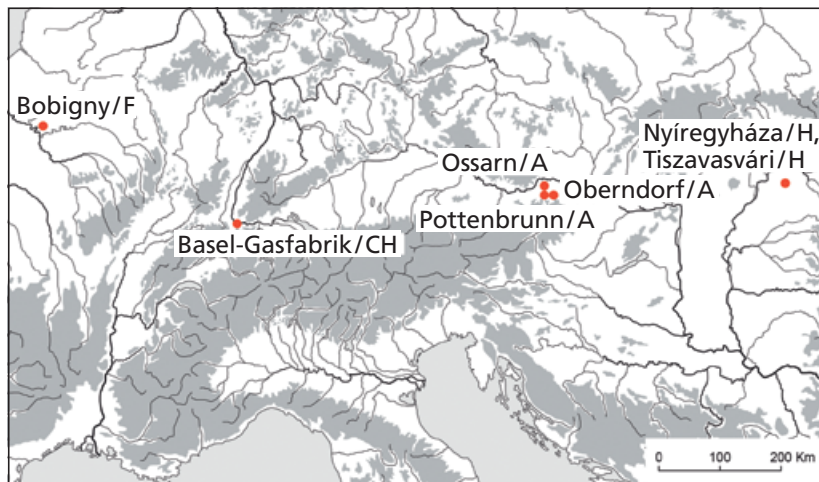
Fig. 1 Location of the seven La Tène period sites in Austria, France, Hungary and Switzerland analysed in the present study. – (Map ABBS, P. von Holzen).